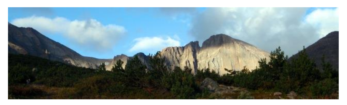
West Virginia view